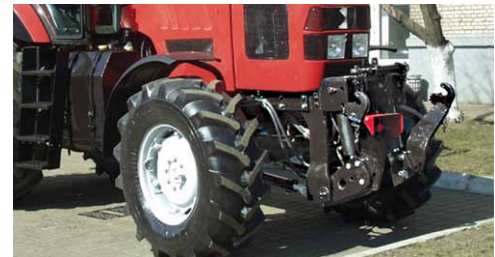
Available front hitch and PTO package