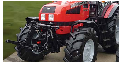
Available front hitch and PTO package