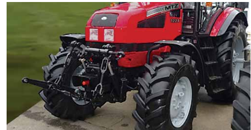
Available front hitch and PTO package